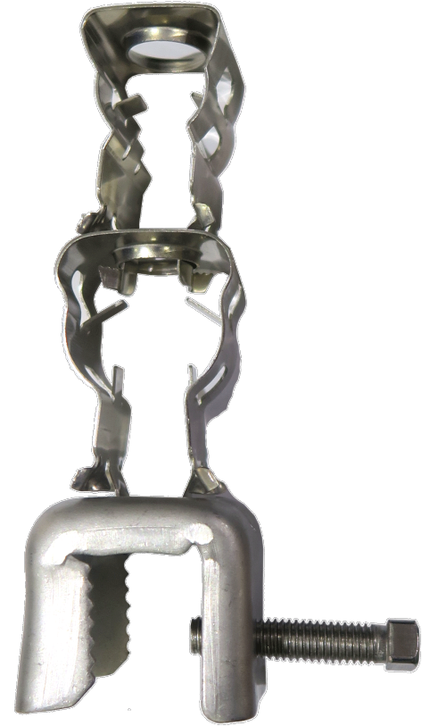
23202025N 7/8" S/Steel SnapIn Hanger