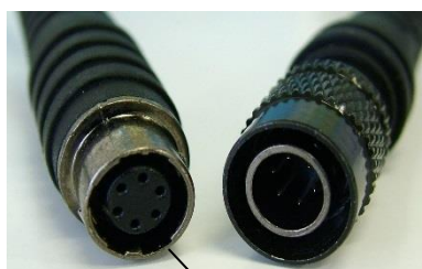
Keyed H interface

Benelec Universal H termination system means several accessory options can terminate to the same radio. Further it future proofs your inventory as the accessories can be used with any radio platform. The H Termination is Keyed so it only goes together one way only. The Slip Ring ensures it will not come apart unless it is lifted by the user. Contact us if you need any other radio brand or model covered.