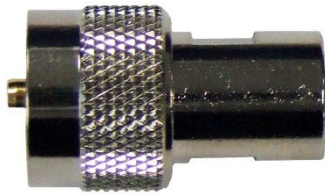
041011 UHF PL-259 plug