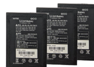
06105109 Battery x 3