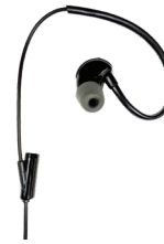
07835B4 Lightweight In Ear Headset Inline