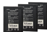
06105109 Battery x 3