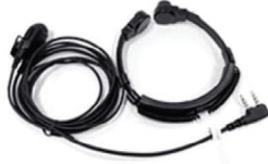
07841B4 Throat Microphone with Air Tube Earphone and On/Off Switch