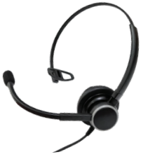
078421Y1 Single Ear Boom Mike Light Weight Headset