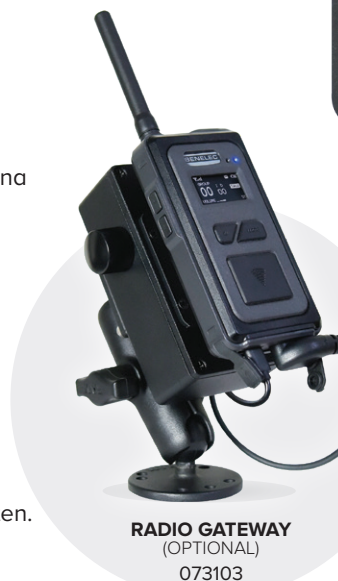
RADIO GATEWAY (OPTIONAL) 073103

AES 128 bit encryption is provided with each radio. Each talk group is individually able to have separate encryption keys.