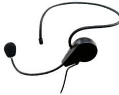
07842B4 Ultra Light Headset