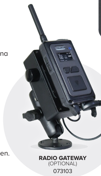
RADIO GATEWAY (OPTIONAL) 073103