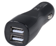
090705420 Dual USB 4.8Amp 12 VDC Adaptor