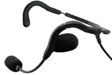
0784234B4 Rugged Light Single Ear Headset