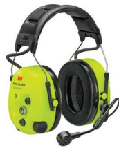
078521H Peltor™ WS™ ProTac XPI Headset