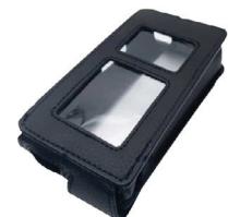
06107310 Leather Carry Case