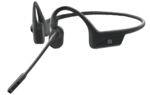
078604A Bluetooth Bone Conduction Headset