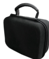
Carry Case with Foam Insert