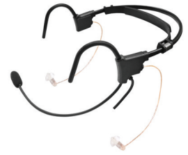
0784233B4 Tempest 2 Ultra Light Headset