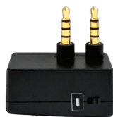
07892B4 Wireless Headset Interface