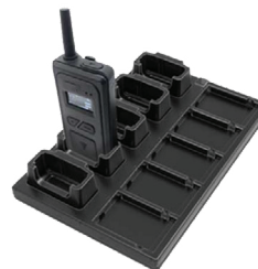
0610525 Drop-In 5 Bay Rapid Charger with 5 Batteries Simultaneously