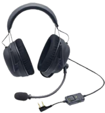
078511B4 High Noise Headset with Boom Microphone