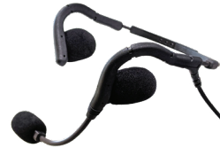
0784235B4 Dual Ear Light Heavy Duty Headset